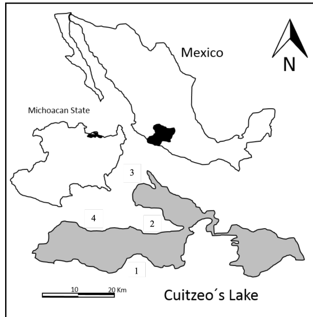
Figure 1. Loggerhead Shrike study area at the northern portion of the state of Michoacán. Study sites are shown with numbers: 1) San Agustín del Maíz, 2) Cuitzeo-San Agustín del Pulque Road, 3) Ejido Epifanio C. Pérez, and 4) Cuitzeo-Huandacareo Road.

utes such as clutch size, hatching success and duration of incubation and brooding periods, are key to determine how populations are responding to local environmental factors and whether these might change in relation to anthropogenic activities.