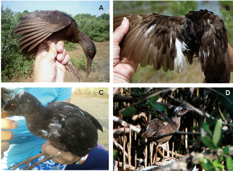
FIG. 2. Plain-flanked Rails showing progressive greying: A) Captured individual with few white feathers in head and neck at Morrocoy National Park. B) Captured individual with white secondary feathers, wing covers, and back at Cuare Wildlife Refuge. C) Captured rail with extensive leucism in head and body feathers at Cuare Wildlife Refuge. D) Individual at La Ciénaga showing leucistic feathers in head, back, and rump.

February 2013) had white feathers on the neck and some white primaries. Two other rails, captured at Cuare Wildlife Refuge, showed extensive progressive greying: one (28 June 2014) had white color on two secondary feathers in both wings, wing covers, head, back, rump, and tail (Fig. 2B), whereas the other individual (16 December 2014) presented white feathers in its head, neck, breast, and back (Fig. 2C).