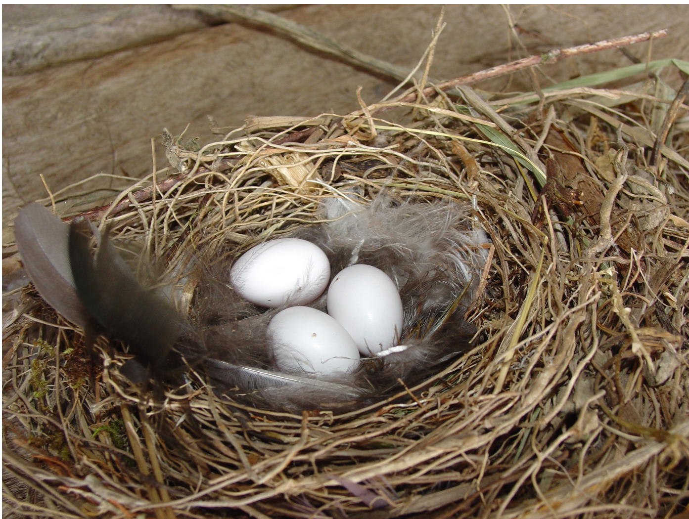
Figure 1. Typical Blue-and-white Swallow ( Pygochelidon cyanoleuca ) nest of pale rootlets, fibers, moss, grass blades, thin sticks, and a feathered lining. This nest was located under the eaves of Yanayacu Biological Station and Center for Creative Studies, Napo Province, Ecuador. Note the pale brown flecking on the eggs.

spent considerably more time compared to the male (1.3 vs. 0.6 h, respectively).