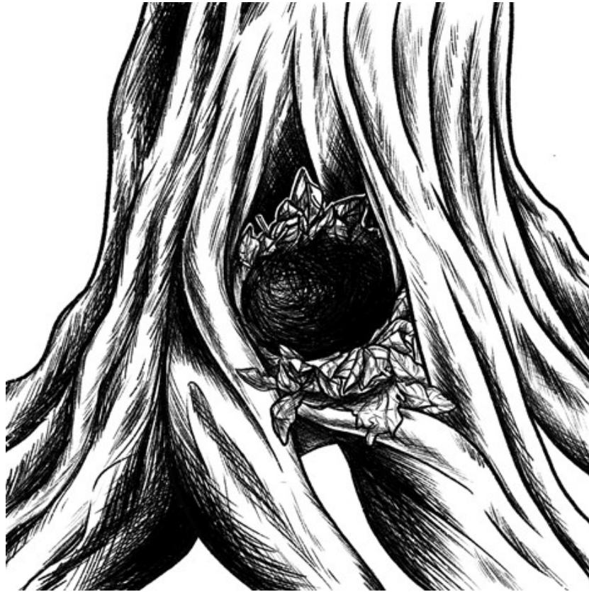
Figure 2. Illustration of the nest of the Brown-Winged Schiffornis ( Schiffornis turdina steinbachi ). Made by: José Alejandro Riascos.

ground), supported from below by the tree root and protected laterally by the tree trunk (Figure 1A-B, Figure 2). The nest structure consisted of two layers: an external layer made up almost entirely of loosely woven dry dicot leaves (7.06 g) and a thin internal lining of dark, flexible, dry rootlets (0.94 g). The outer dimensions of the cup were 76.8 mm long by 73.0 mm wide and 82.2 mm in external height. Inner dimensions were 75.5 mm long by 47.7 mm wide, 48.5 mm of inner depth, and a nest wall thickness of 32.3 mm.