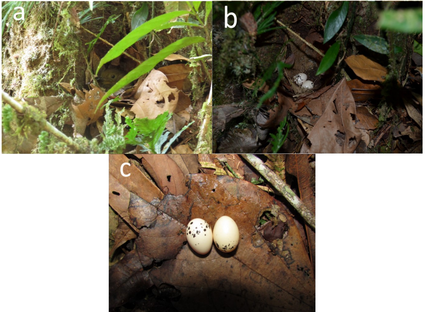
Figure 1. Photographs of the nest and eggs of the Brown-Winged Schiffornis ( Schiffornis turdina ), found in the Pantiacolla lodge at Manu National Park, Madre de Dios, Peru. A) An adult in the nest; B) Eggs in the nest C) A close-up view of the eggs outside the nest.

ly distributed S. turdina currently includes the subspecies Schiffornis turdina wallaci , Schiffornis turdina amazonum , Schiffornis turdina turdina , Schiffornis turdina intermedia and Schiffornis turdina steinbachi (Nyári 2007, Snow & Kirwan 2019).