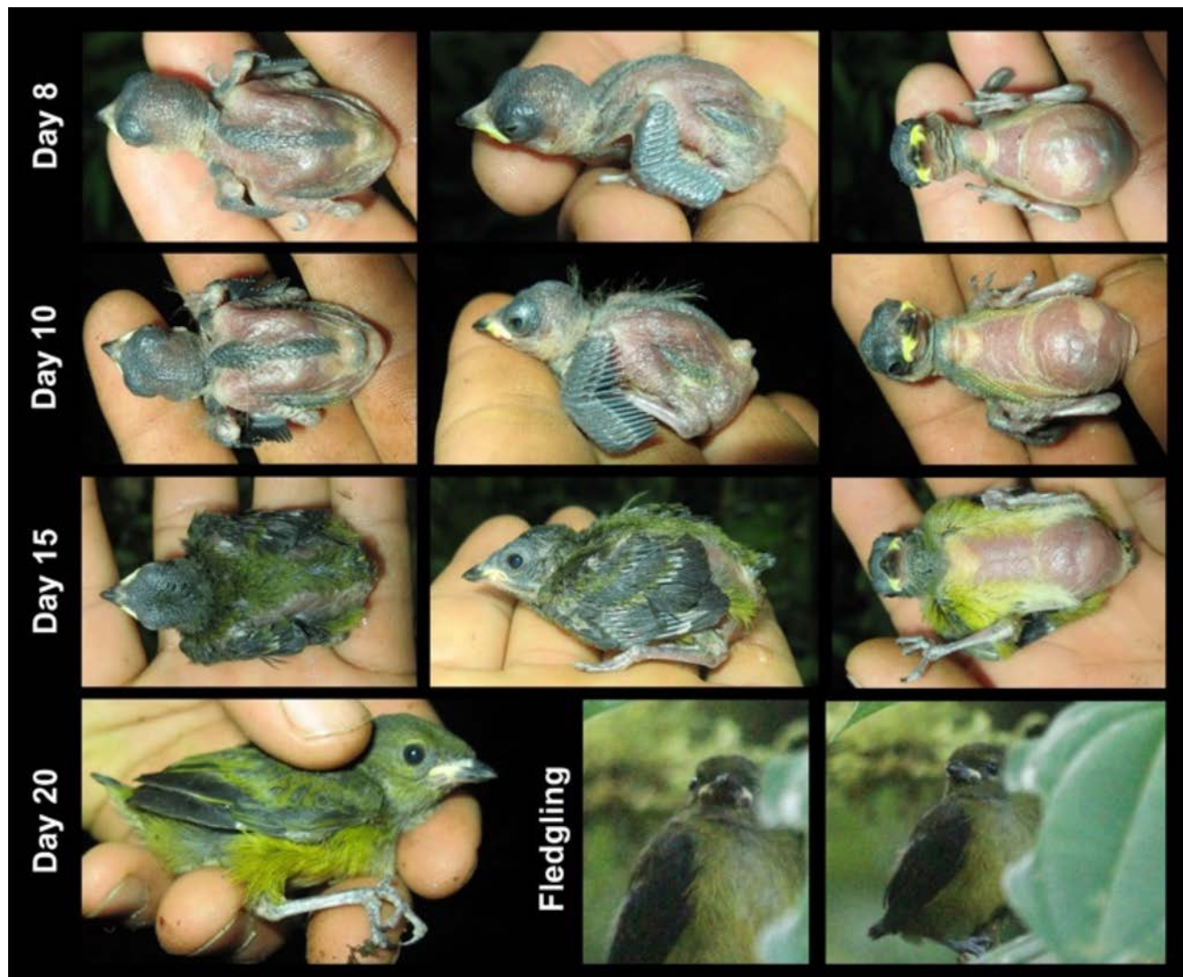
Figure 2. Euphonia xanthogaster brevirostris nestlings 8–20 day old. All nestlings photographed by JS at Yanayacu Biological Station. The fledgling (also E. x. brevirostris ), of unknown age, was still being fed by adults when photographed by HFG 14 November 2015 at Chontayacu, northeast of Archidona, 1100 m.

feathers of all areas except the head had emerged, roughly one third to one half of the way from their sheaths. This gave them a largely feathered appearance, but emerging feathers did not yet fully cover the spinal, femoral, and ventral apteria. Most of the head, including the face and crown, remained largely bare, with green contour feathers just beginning to break their sheaths on the hindcrown. Their tarsi and toes were now mostly gray or dusky pinkish, their bills remained contrastingly colored as described above. At twenty days of age (Figure 2, row 4), one to three days prior to fledging, nestlings were fully alert and, after being handled, remained in the nest only if returned with their heads facing the rear of the nest chamber and their exit blocked for 20–30 seconds. Their wings were almost fully developed, with only the basal 2–3 mm of the primaries remaining sheathed. Their tail feathers, however, remained partially sheathed and only 10–12 mm long. Their bodies and heads were fully covered with feathers, predominantly bright olive green above with yellowish highlights on the wings and face. The breast and flanks were yellow-green, the throat and lower breast were grayish, becoming buffy on the lower belly and vent. During the final days before fledging, their bills became largely black, retaining only a thin whitish line along the tomia. The rectal flanges remained inflated, but lost most of the yellow, becoming notice-