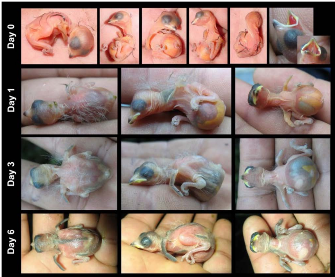
Figure 1. Euphonia xanthogaster brevirostris nestlings 0–6 day old. Hatching-day nestlings were photographed by HFG in mid March 2003 at Yanayacu Biological Station (YBS). The remainder were photographed by JS in February of 2009 at YBS.

seen through the skin. Nails were dusky, as was the distal half of the bill and most of the culmen. Basally, the bill was pink except for the bright white, slightly inflated rictal flanges. The tomia of both, the mandible and maxilla, were also bright white, with the inner margins of the flanges and tomia washed with yellow, most intensely and extensively at the corners of the gape. The mouth lining was red and the egg tooth was small and pale gray, barely contrasting with the dusky tip of the maxilla. Chicks hatched with two rows of widely spaced, wispy tufts of natal down, one on either side of the spine, which extended from the scapular region to the lower back. Three to five tufts of natal down adorned the alar tracts, and several were present at the rear of the capital tract. Once the down had dried and expanded, within several hours of hatching, it was so fine and wispy to be barely visible, making the young nestlings appear nearly naked. During the first day or two after hatching, the skin lost its orangish coloration, becoming dusky pinkish, and the yellow wash on white portions of the bill and gape became more extensive and brighter (Figure 1, row 2).